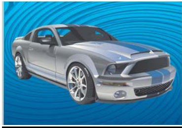
Drawing by Vecteezy